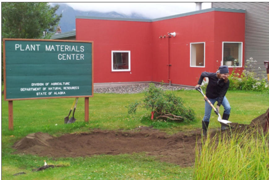
Matanuska-Susitna Borough staff prepares the ground for a rain garden

The rain garden project was featured in the PMC's August newsletter. They will be monitoring the garden to see what plant varieties are successful.