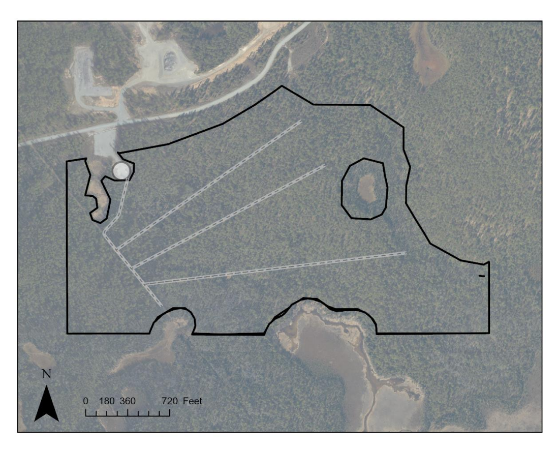
Exhibit A 125-acre W. Susitna Pkwy Salvage Timber Harvest Area