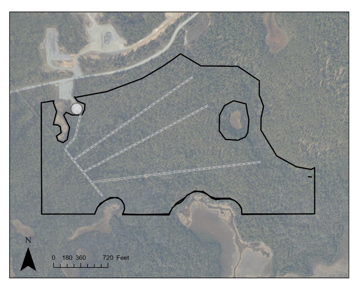
EXHIBIT A - CONTRACT AREA MAP