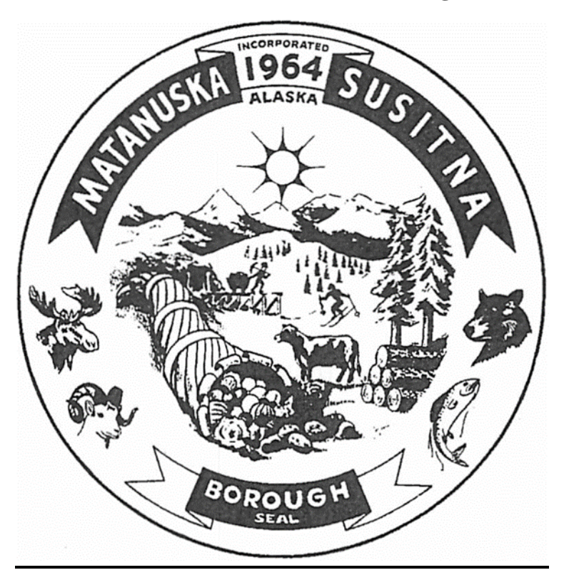
SECTION IV CONTRACT AGREEMENT (38 Pages)