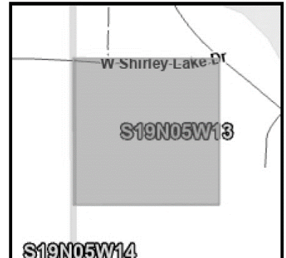
Parcel location within Matanuska-Susitna Borough

Legal Description: TOWNSHIP 19N RANGE 5W SECTION 13 LOT C2