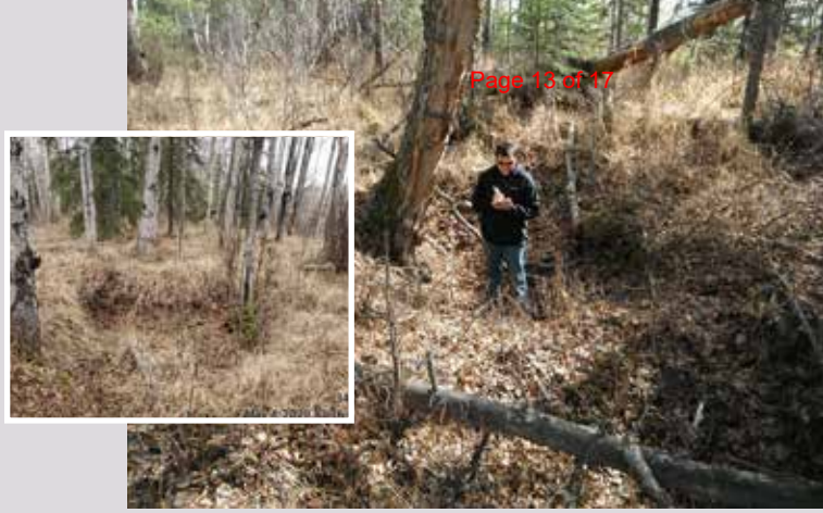
KNIK TRIBAL COUNCIL

Participants emphasized Native representation in particular. One respondent wrote: "There needs to be an acknowledgement of the Native People who have lived here for thousands of years."