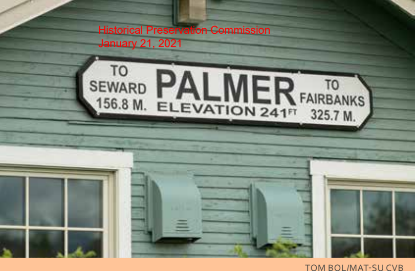
The historic depot in downtown Palmer, now revitalized as a community building.