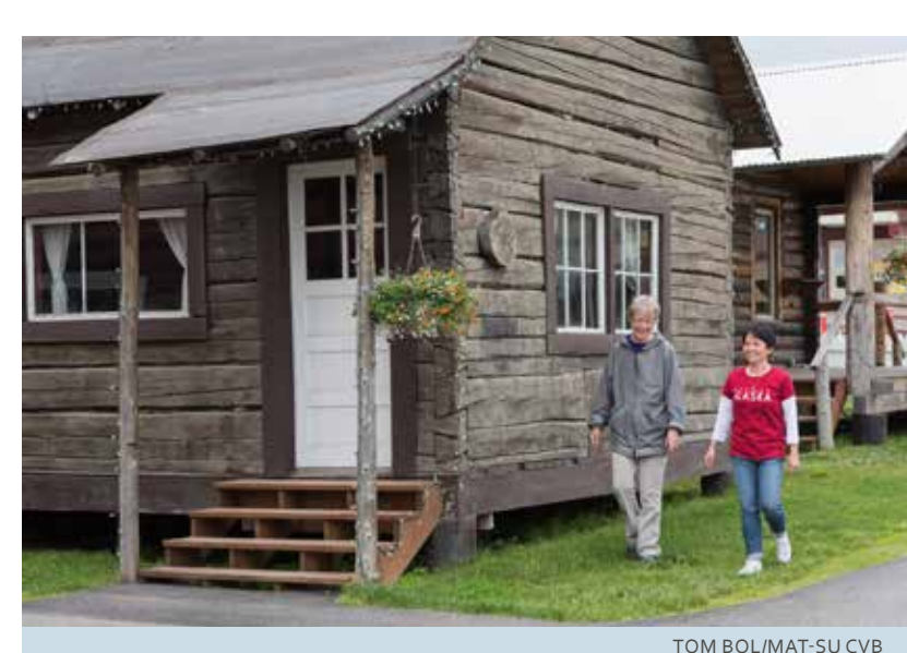
Visitors enjoy the historic town site at the Wasilla Museum and Visitor Center in downtown Wasilla.

However, it's likely that the Mat-Su region of 2020 would be unrecognizable in some respects to those who developed the 1987 HPP. With the fastest growing population in Alaska for many years and significant developments in our economy, in tourism in particular,