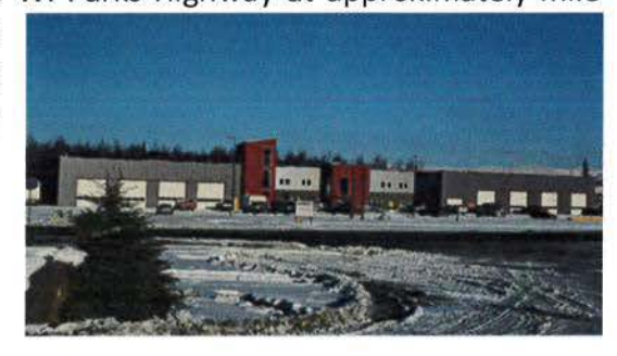
Right: Station 7-3 Exterior

Districtwide HVAC Upgrades Design, ($7.1M) Electronically controlled ventilation dampers and control valves are currently being installed throughout the project under two different contracts effecting 10 schools. Complete renovation of boiler rooms for both Palmer Junior Middle and Willow Elementary Schools were successfully completed. Substantial Completion Inspection was held successfully at both Wasilla Middle and Palmer Junior Middle this month. Commissioning is anticipated over Christmas break. A third contract for upgrading the HVAC system at the MSBSD Warehouse was awarded this summer with work now beyond Substantial Completion and in the one-year warranty phase. A fourth contract for HVAC improvements at Colony Middle School are in the process of design award for winter design and summer 2018 construction.